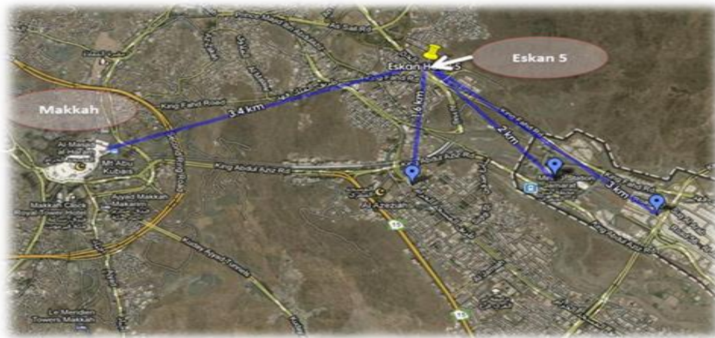
Map (2): Location of Eskan Tower 5

The Fund Manager acknowledges that there is a direct or indirect conflict of interest between the following parties with respect to Eskan Tower 5