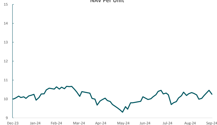
NAV Per Unit